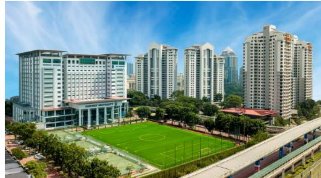
Lancaster University has a partnership with Sunway University, Malaysia