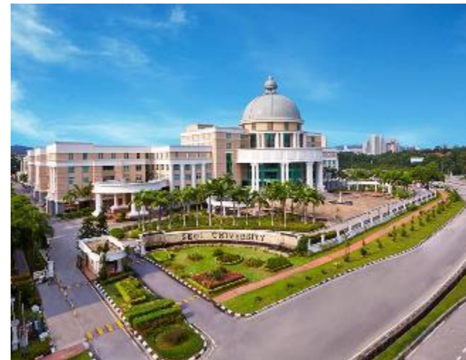
UCLan also has a partnership in Malaysia with SEGi University